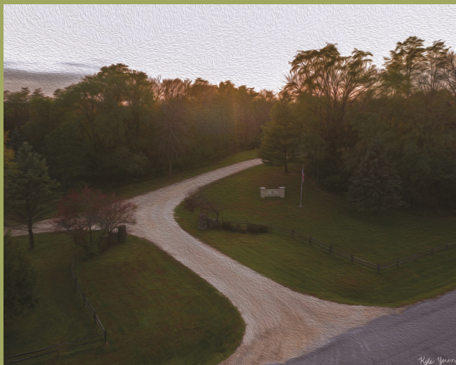
2024 Friends of Scouting Print Welcome to Wakonda