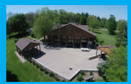
OTHER FACILITIES AVAILABLE