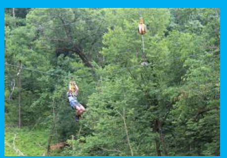
THE "BIG ZIP" LINE