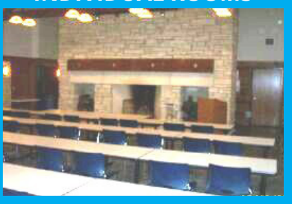
TABLES & CHAIRS AVAILABLE