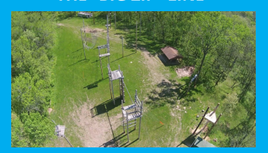
THE AEGON CLIMBING CENTER & CHALLENGE COURSE